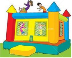
Kids Bounce House