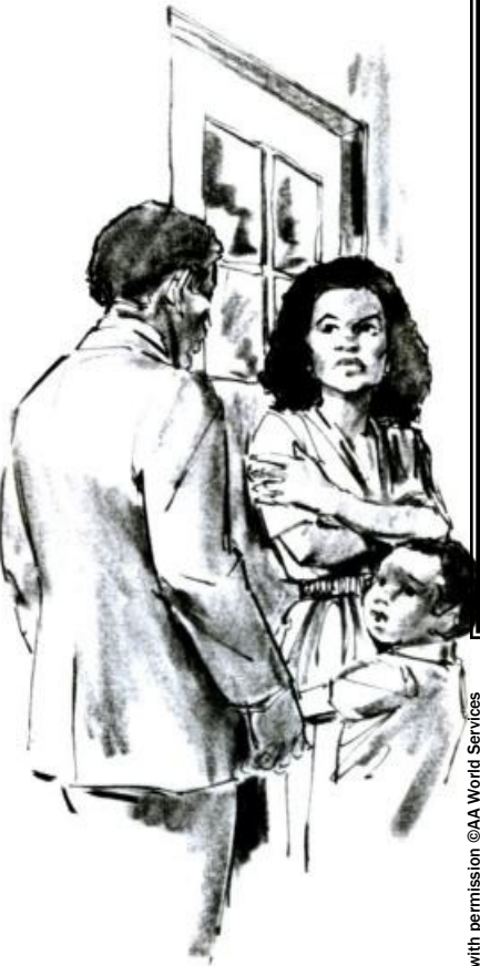
I try to fix things if I can.